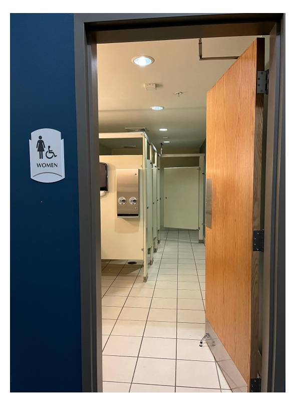
The women's bathrooms are to the right of the box office, and the men's are to the left side of the bar area.